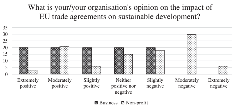
Figure 2. Opinion on impact EU trade agreements on sustainable development (in percentages; business n = 10, non-profit: n = 32).