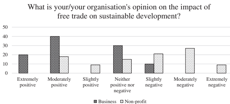
Figure 1. Opinion on impact of free trade on sustainable development (in percentages; business n = 10, non-profit: n = 32).

This might lead to the conclusion that these civil society organisations have become less critical through their co-optation within EU mechanisms. If we consider the anti-TTIP and anti-CETA protests, which took place at the time when the survey was held (August-September 2016) and are remarkably strong both in terms of intensity (heavily anti-trade) and scope (proliferation of civil society organisations mobilising against these agreements), we might have expected a more outspokenly negative evaluation by labour, environmental, development, human rights and animal welfare organisations. In other words, non-profit organisations participating in the mechanisms seem generally less critical of free trade and EU trade agreements than most civil society organisations that are campaigning on trade issues. Nevertheless, it would be premature to conclude that this more positive inclination